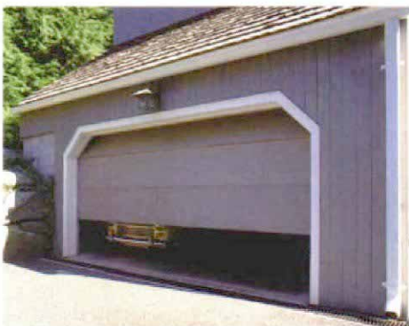
Flush wooden door

both Gadco and Overhead consider their plastic doors to be their top of the line, and both are sold with extended warranties.