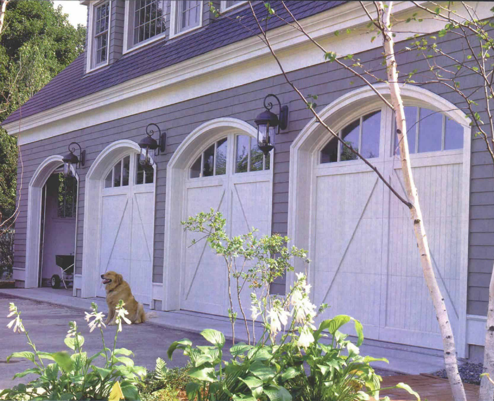
Custom-made overhead doors