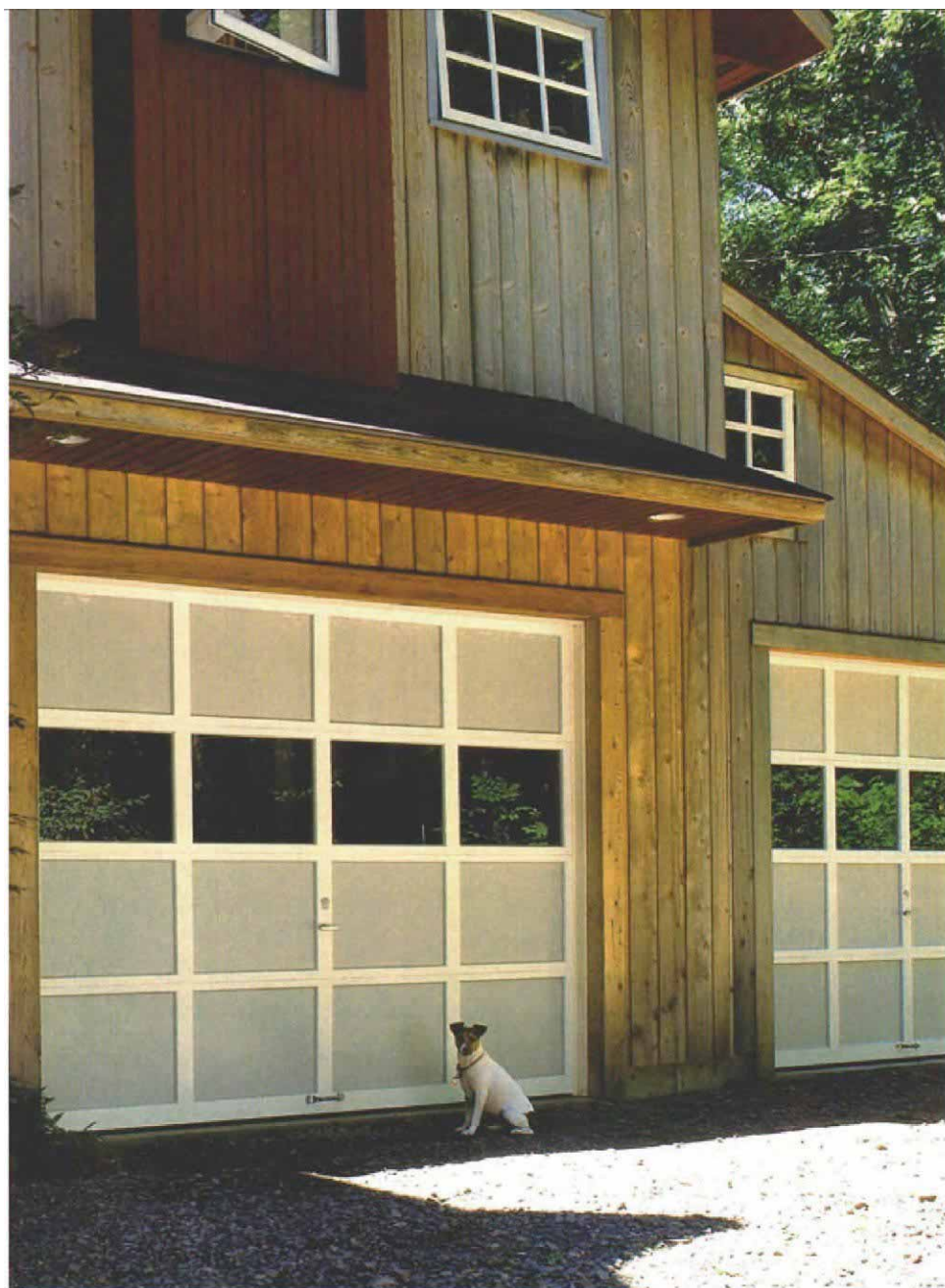
Frame-and-panel wooden door

I had a translucent-fiberglass door on my garage in Rhode Island, and I was surprised to find out that few companies still make these lightweight doors, which offer little insulative value. Filuma Door Company (905-457-7553) of Ontario, Canada, manufac-